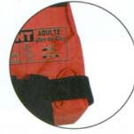
Orange buddy line