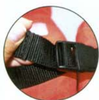
Adjustable strap (70178-70179)