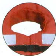
Comfortable fit around the neck