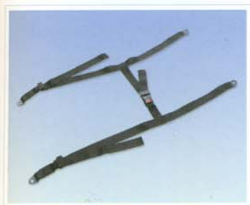
方扣四点式 Four-knot type