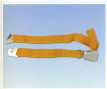
二点式 Two-knot type