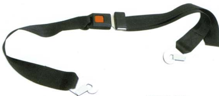
方扣二点式 Two-knot type