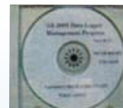
GX-2009 data logger management program