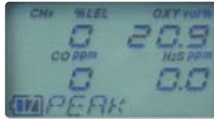
▲ Peak screen