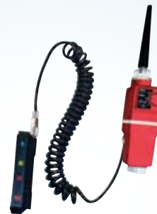
Pump unit Model RP-6