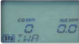
▲ TWA screen