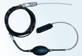
Hand aspirator sampling kit