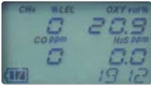
▲ Normal measurement