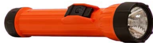
WorkSafe™ Model #2224LED